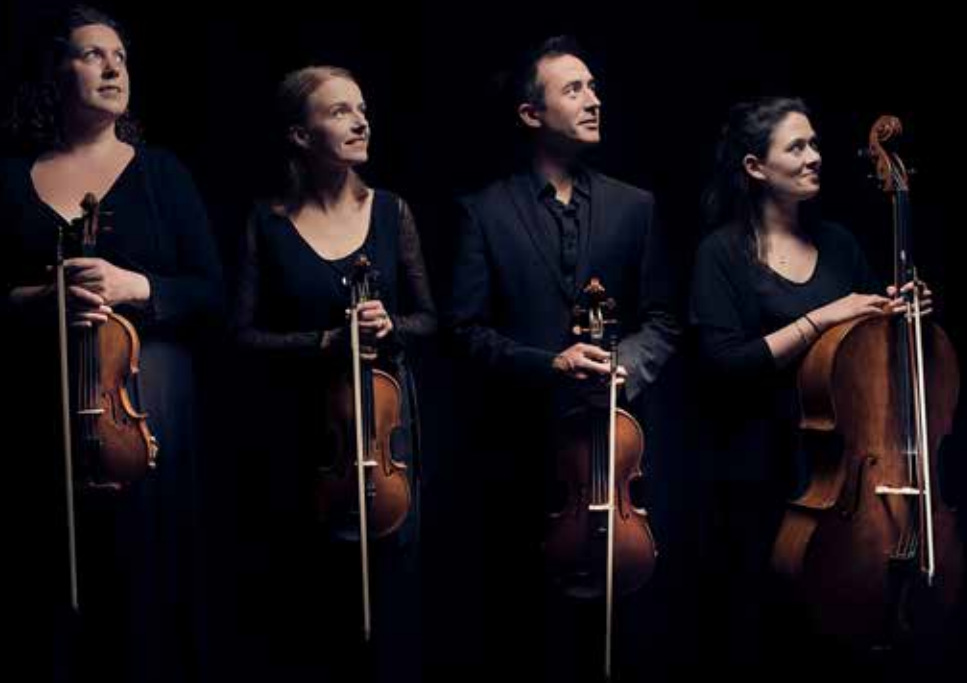
figure in Poland's musical life during and after the Second World War; Jane O'Leary's 'Forever Begin', which was written in 2020 as 'a sort of fanfare for strings - conveying a sense of excitement, anticipation, hope and'; and finally, Dvořák's popular and irrepensible 'American' quartet celebrates the composer's new-found enjoyment of American folk music.

The Banbha Quartet is one of several fine new Irish quartets promoted by the National String Quartet Foundation and establishing an exciting reputation amongst audiences throughout the country. For this tour, they bring a fascinating repertoire: Haydn's ground-breaking and masterly Op.20 set of quartets from 1772; Grażyna Bacewicz's Quartet No. 4, one of the best known by this Polish violinist/composer who was a leading